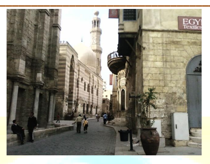
Figure 1 shows Elmoaz Idin Allah Street

2.The current form of Museum Services the tourist during his visit to Long Street, such as our museum this to rest and eat what it needs from the foods and drinks to fill assuage his hunger and extending energy to complete the trip, do not find him, but street vendors who go back door to work indiscriminate they entered to offer their services are unregulated and warped to the place as well as contrary to the nature of the archaeological area during Touring wagon to provide Kosheri wraps around people from the locals eat their food and characterized cart popular character in terms of format and presentation as shown in Figure (2)