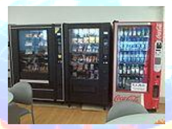
Figure 7.showing Full-line vending machine 4.States that have used such devices

A full-line vending company may set up several types of vending machines that sell a wide range of products as shown in figure (7). Products may include candy, cookies, chips, fresh fruit, milk, cold food, coffee and other hot drinks, bottles, cans of soda, and even frozen products like ice cream. These products can be sold from machines that include coffee, snack, cold food, 20-oz. bottle machines, and glass-front bottle machines. In the United States, almost all machines accept bills with more and more machines accepting $5 bills. This is an advantage to the vendor because it virtually eliminates the need for a bill changer. Larger corporations with cafeterias will often request full line vending with food service.