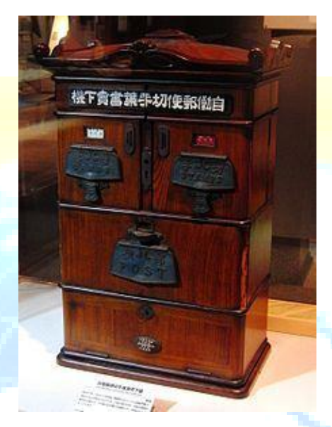
Figure 8.showing first vending machine in japan

The first vending machine in Japan was made of wood and sold postage stamps and post cards as shown in figure (8). About 80 years ago, there were vending machines that sold sweets made by the "Glico Company". In 1967, the 100-yen coin was distributed for the first time, and vending machine sales skyrocketed overnight.