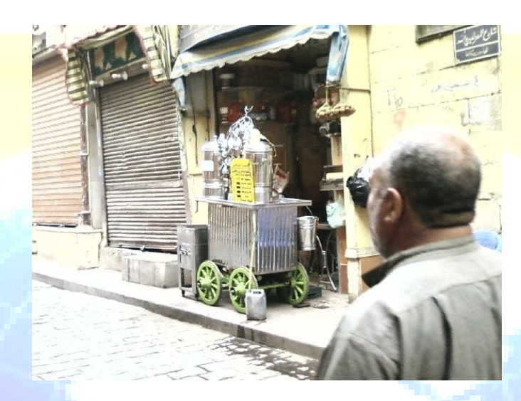
Figure 4 shows the shop to provide the People 's Food and Beverage

The shops that offer dishes at home not only so she added other activities to increase their profits and provide its customers drinks They established additional modules as a natural extension of the stores and are not compatible with the nature of the archaeological area , which gives an opportunity to shop the other to follow this method of random and appears evident in the form of