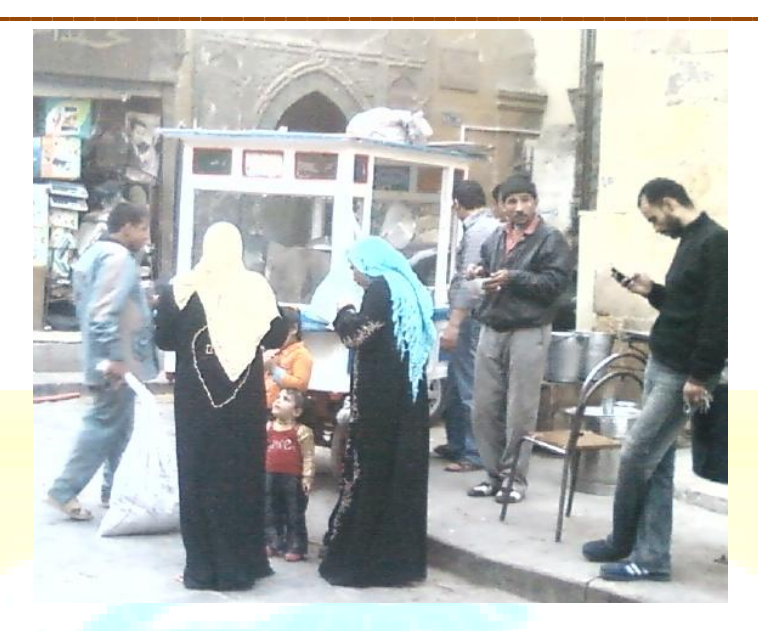
Figure 2 - b . shows cart Kosheri and around people

In this area of slums in the provision of services observe the provision of water to passers - by individually voluntary self-help to the residents of the neighborhood or to one of the owners of shops in the steel rustproof as shown in Figure (3)