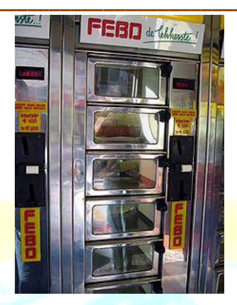
Figure 8.showing Avending machine in Netherlands