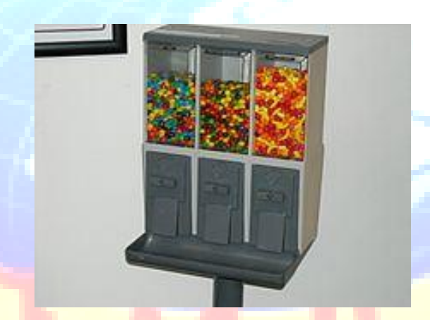
Figure 6.showing Bulk candy and gumball vending machine

Bulk vending may be a more practical choice than soft drink/snack vending for an individual who also works a full-time job, since the restaurants, retail stores, and other locations suitable for bulk vending may be more likely to be open during the evening and on weekends than venues such as offices that host soft drink and snack machines.