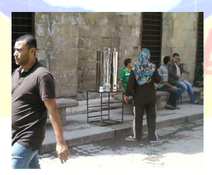
Figure 3 shows a metal pot to provide water to passers - by

In this area of slums in the provision of services observe the provision of water to passers - by individually voluntary self-help to the residents of the neighborhood or to one of the owners of shops in the steel rustproof as shown in Figure (3)