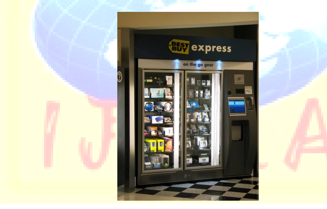
Figure 5.showing A vending machine

To prevent injuries or death from tipping or striking the machine, most modern snack vending machines equipped with spirals to hold products contain lasers near the access door at the bottom. If a purchased item does not break the laser beam when falling, the spirals will automatically turn, usually three times to ensure that a product will fall. If this still does not occur, the customer will be asked to make another selection or will be refunded their money, it's types as follow: